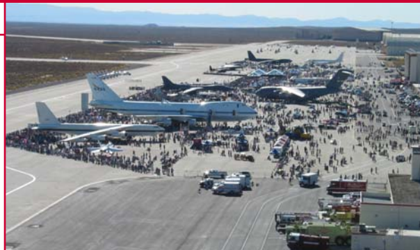
Crowds eagerly await the beginning of the Thunderbirds aerial demonstration along the Edwards AFB flight line.

When a loved one is deployed overseas it can be trying both financially and emotionally for those left to carry on here at home and especially so during the holidays. Each year Civ/Mil conducts a "Holiday Gift" program to benefit the families of those enlisted personnel who may need a helping hand. In keeping with this tradition Civ/Mil provides gift certificates for the Edwards Commissary to those families selected by their senior NCO's. Your generous donation of $25.00 will help bring holiday cheer to a deserving family. If you wish to donate, please mail your check payable to EAFB Civ/Mil and marked "Holiday gift" to EAFB Civ/Mil—PO Box 812 Lancaster Ca. 93535 Thank you!