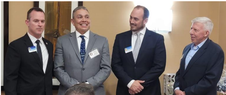
EAFB Civ-Mil Officers

The purpose and general nature of the Edwards Air Force Base Civilian-Military Support Group is to establish a friendly, benevolent association of civic leaders and military personnel at Edwards Air Force Base, to act as a host group whenever needed and additionally, to consider an annual service project to benefit EAFB.