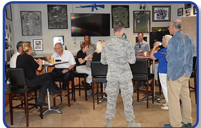
Civ-Mil Community Outreach Day concluded with a reception at Club Muroc.