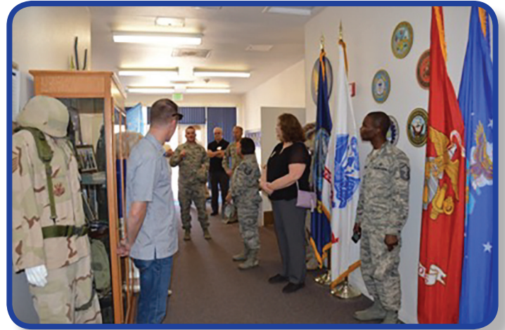
Civ-Mil enjoyed a tour of Airman Leadership School.