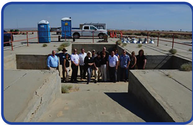
Civ-Mil group photo at the X-1 Loading Pit.