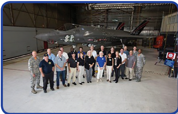
Civ-Mil Community Outreach Day included a briefing on the F-35.