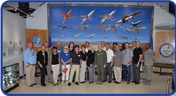
Civ-Mil Outreach Day group photo at the EAFB Museum.