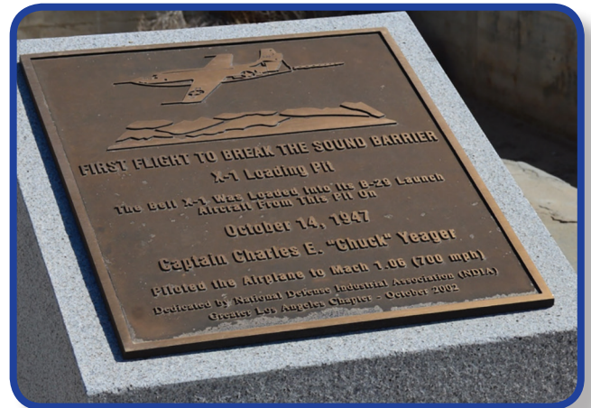
X-1 Loading Pit historical marker.